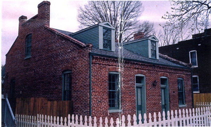
2238-40 Jules pictured