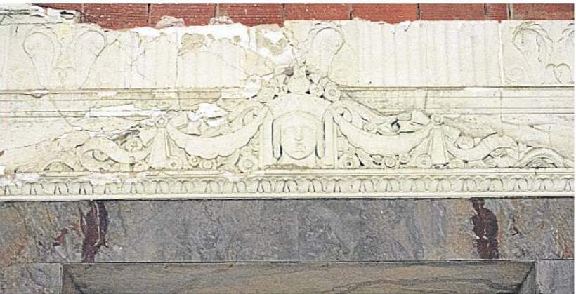
Plaster ornamentation over a door is shown inside the Warrior Hotel in downtown Sioux City.